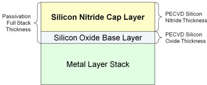
Fig. 1. Metal Passivation Layer Structure: Silicon Nitride cap layer and Silicon Oxide base layer, deposited in a PECVD process sequence for passivation of the underlying metal layer stack.

Relevant previous work comprises [6], in which the authors make use of the Monte Carlo simulation to enhance the Design of Experiment (DoE) data sets, and model the relation between the input variables and the output variable using a back propagation neural network. In [2], the authors propose to use a radial basis function neural network to model the dependence of the output variable on the input variable. However, the models are derived using process parameter data from real production equipment, instead of DoE data sets. Comparing a multiple linear regression model (using a stepwise procedure for selecting the input variables) with a multi-layer perceptron neural network and a radial basis function neural network is the focus of a study carried out in [7]. The authors of [8] use the multiple linear regression with stepwise selection in order to determine a set of input variables, which are in turn fed into a back propagation and a simple recurrent neural network model to predict the output variable. In [9] the data set is divided into an in-spec and an out-of-spec data set, and the Classification And Regression Tree (CART) is used to predict when a production wafer